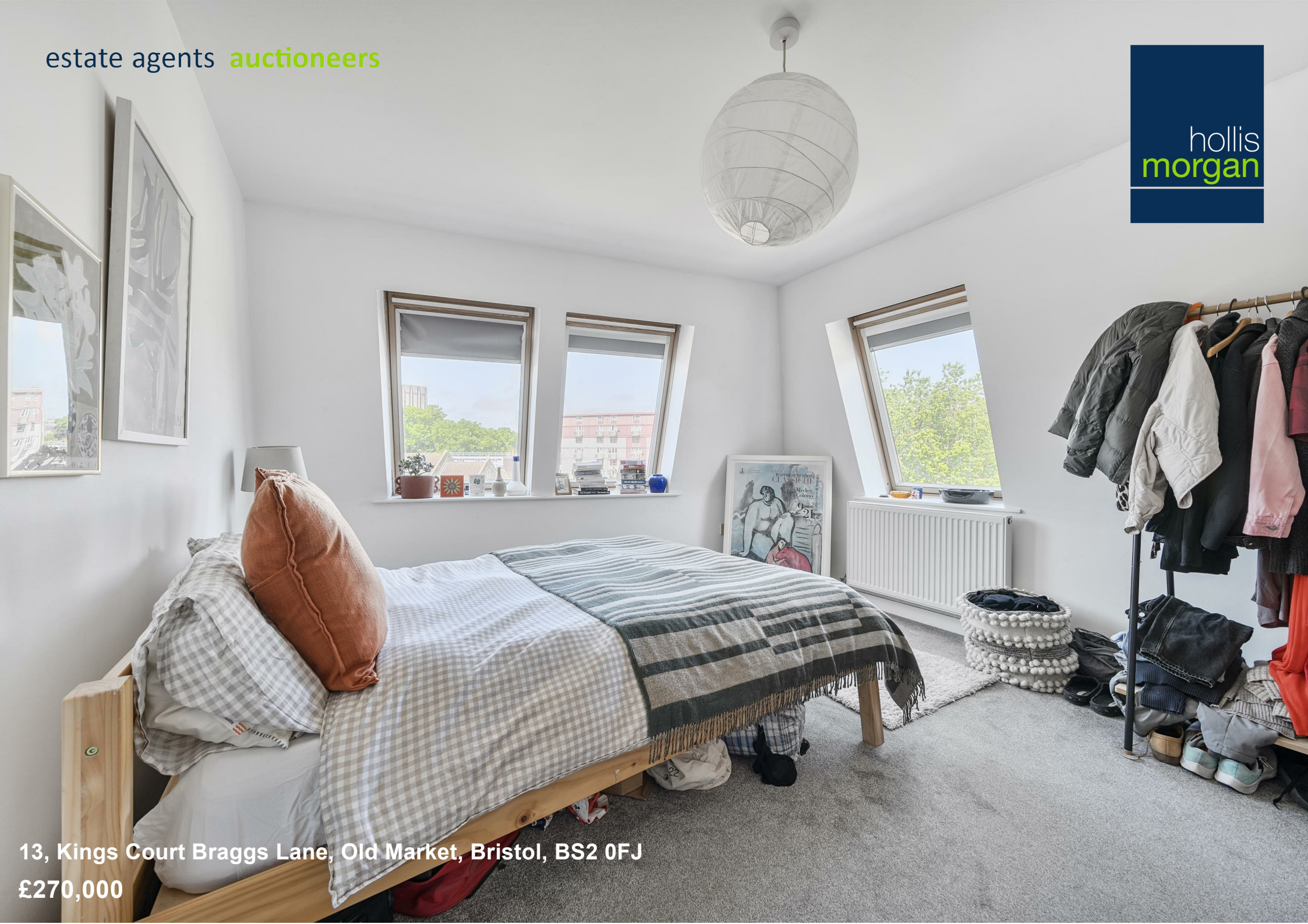
13, Kings Court Braggs Lane, Old Market, Bristol, BS2 0FJ £270,000